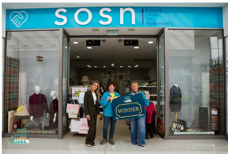
Scottish Business Awards Winner

The organisation has continued to grow and evolve. In 2022, SOSN moved into larger retail premises in Stirling town centre and proudly gained charitable status. More recently, in summer 2025, the charity relocated to its current home in the Thistles Shopping Centre, making it even more accessible to the local community.