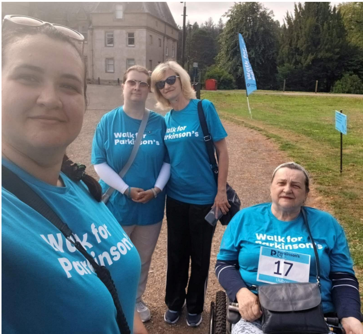
Fundraising sponsored Walk to raise funds for Parkinson's

Alongside fundraising, SOSN works hard to raise awareness of Parkinson's both locally and further afield. Using its shop premises and social media platforms, the charity helps keep the condition visible and better understood within the community.